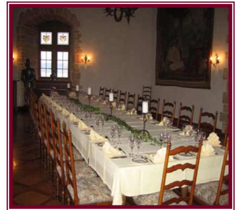
Dinner at a 1,000 year old Castle Swiss Advantage 2009