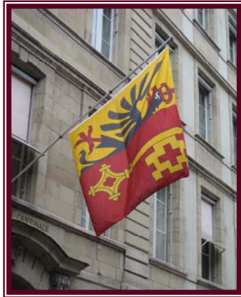
Geneva Swiss Advantage 2009

When most people think of Switzerland, they think of chocolate, beautiful countryside, watches, neutrality and of course, private banking. This is the country where private banking was born and it is one of the reasons why one third of the offshore wealth of the world ends up in this Alpine country.