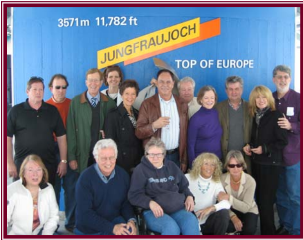
Swiss Advantage Expedition, May 2009

History has taught us not to keep all our assets in one country, one currency or one investment. Join us and learn where in the world to internationalize your assets for wealth protection and asset growth.