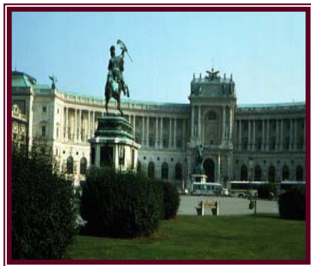
Vienna, Austria 2008

We begin our Expedition in the “Imperial capital” of Vienna where we learn about private banking from one of the oldest banks in Austria. Then we take a boat ride on the Danube to historical Melk then on to the wine town of Durnstein. We stay overnight at a castle on the Danube and hear a discussion about wine as an investment along with some wine tasting. Eventually on to Salzburg to learn about Eastern European real estate as an investment before returning to Vienna for a discussion about art as an investment.