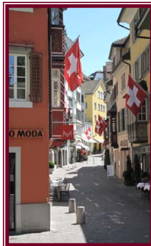
Old Towne Zurich Swiss Advantage 2009