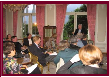
Informative and Personalized Presentation Swiss Advantage 2009

(And what you can expect on future trips!)