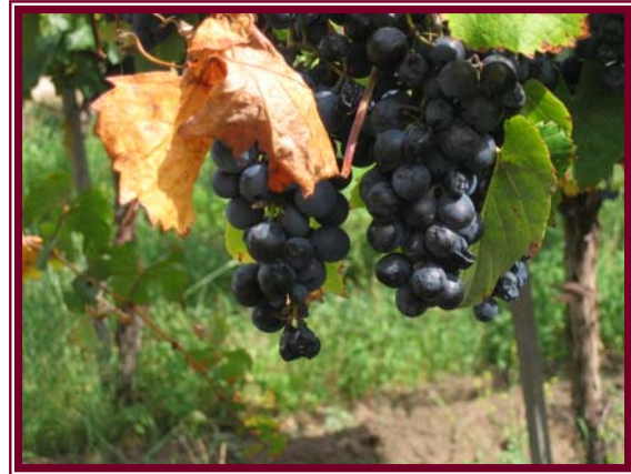
Cafayate, Argentina 2008

With the uncertainty in our own markets, it’s time to look abroad for living and retirement opportunities and investment diversification. And, we’ll have a bit of fun with visits to see tango dancers, enjoying wonderful steak barbecues with delicious Argentine red wines and much more.